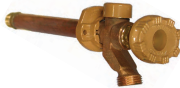
Model 19 Anti-siphon protected.