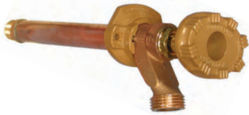
Model 16 No anti-siphon protection.